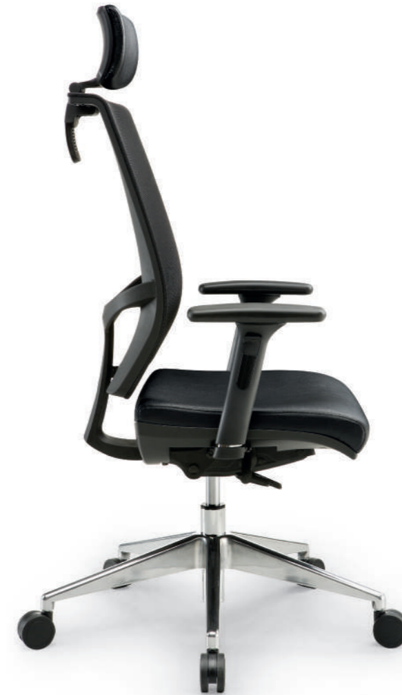
LIVING OPERATIVE CHAIR