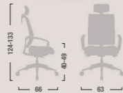
LV11 – LV21 Poltrona ergonomica con braccioli e oscillante mov. 19. Ergonomic armchair with armrests and oscillation mov. 19.