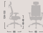
LV10 – LV20 Poltrona ergonomica con braccioli regolabili e oscillante mov. 19. Ergonomic armchair with adjustable armrests and oscillation mov. 19.