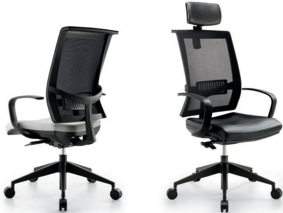
LIVING OPERATIVE CHAIR